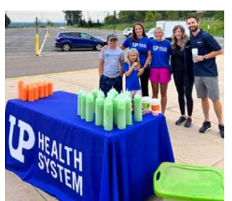
UP Health System – Portage employees participated in the Keweenaw Color Run.